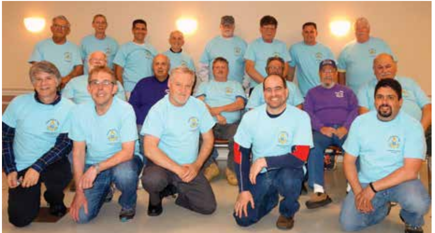
The Brothers of United Brethren who make the Car Show possible

• Promote the event. Marlborough's Main Street Journal has featured the show on its front page, and other media