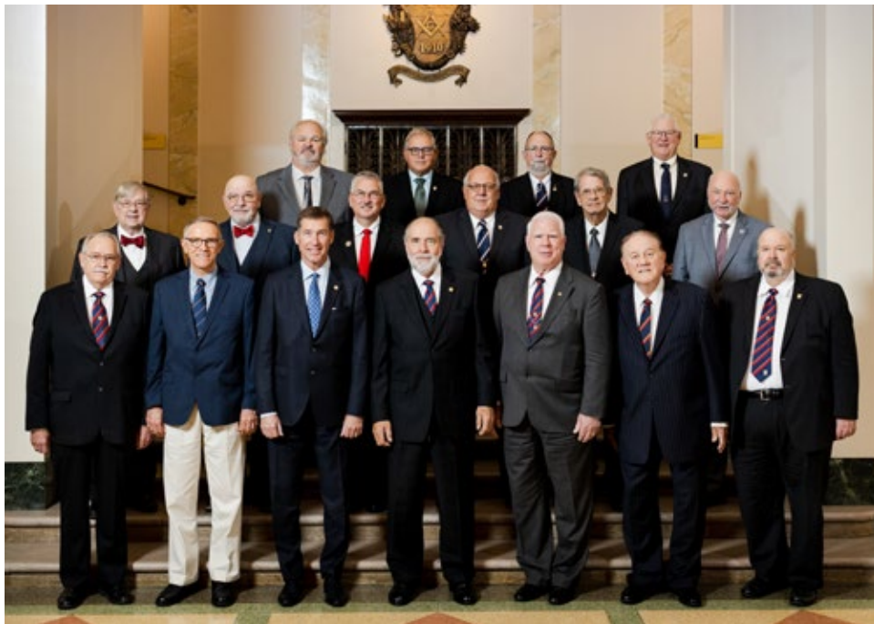
The Board of Directors held a meeting at the George Washington Masonic National Memorial in October. Due to the pandemic, it was their first in-person meeting at the Memorial since 2019.