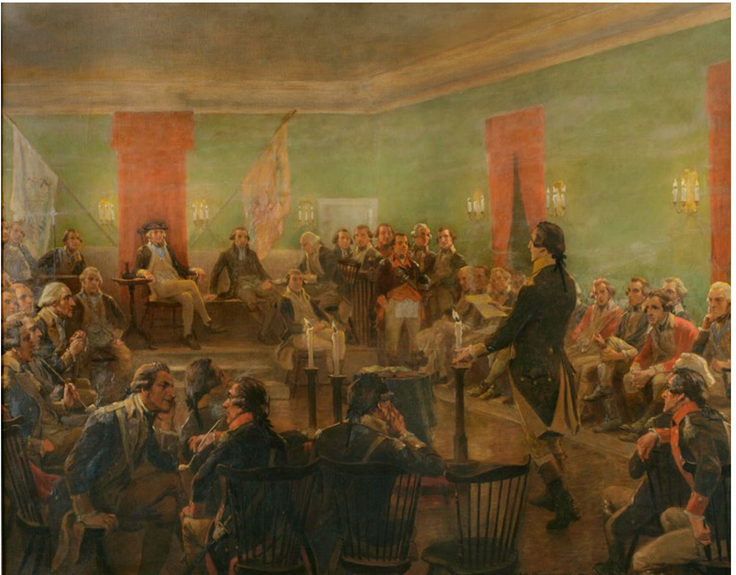
The Petition, John Ward Dunsmore (1856–1945), 1926; oil on canvas; 44 × 60 in. This scene shows George Washington (left) attending a meeting of American Union Lodge at Morristown, New Jersey, December 27, 1779.