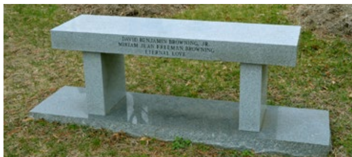
A bench dedication provides an elegant and enduring statement.