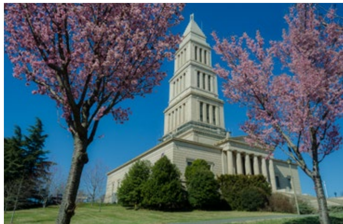
Dedicatory trees complement the Memorial's striking appearance with natural beauty.

Information, including a printable order form, is available on our website at https://gwmemorial.org/products/tree . For additional information about how you can participate in this program with a tree or a bench, please contact George D. Seghers at gseghers@gwmemorial.org or 703-683-2007, ext. 2010.