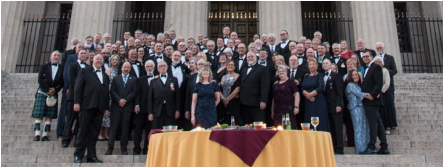
A large delegation from the Grand Lodge of Maine assembles on the front steps of the Memorial during a formal reception held September 25, 2021.